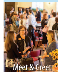
Meet & Greet